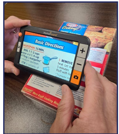
Explore 5 Handheld Magnifier

Our most popular handheld digital magnifier is the HumanWare Explore 5. It is easy to use, with only a few buttons that allow you to change the magnification level and contrast. I have one on my kitchen counter that I use multiple times every day for tasks like sorting through the mail, reading cooking instructions, checking medication labels, and adjusting the thermostat. My favorite feature of this device is the handle, which allows me to hold and adjust the magnification with one hand while holding something in the other.